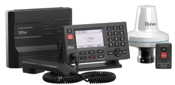
Lars Thrane LT-3100S